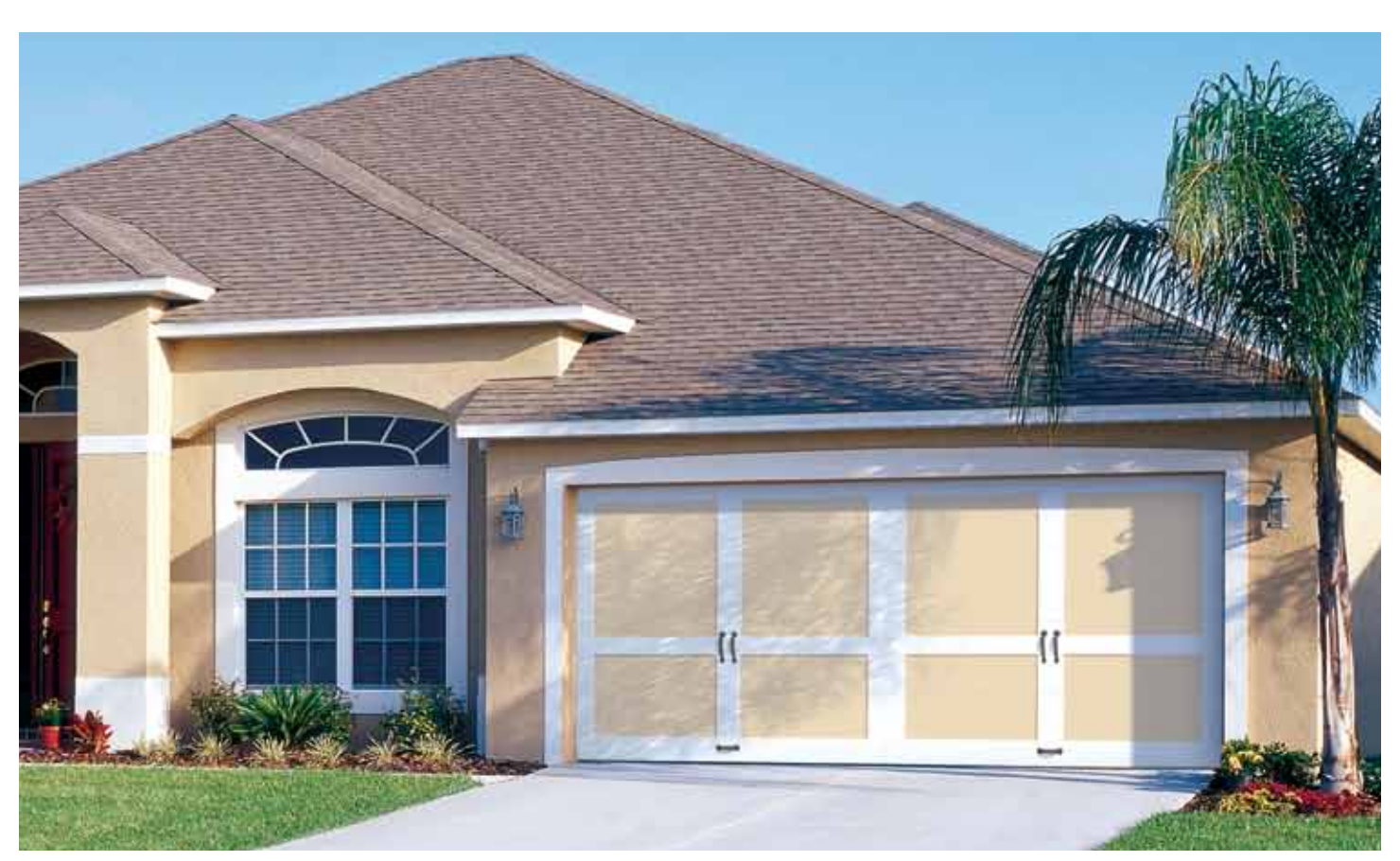
Model 8024 Square Ashburn style shown, custom painted.